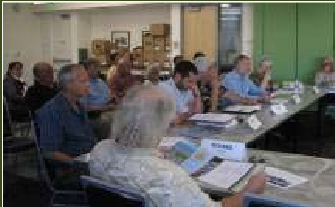
Municipal Water Permit