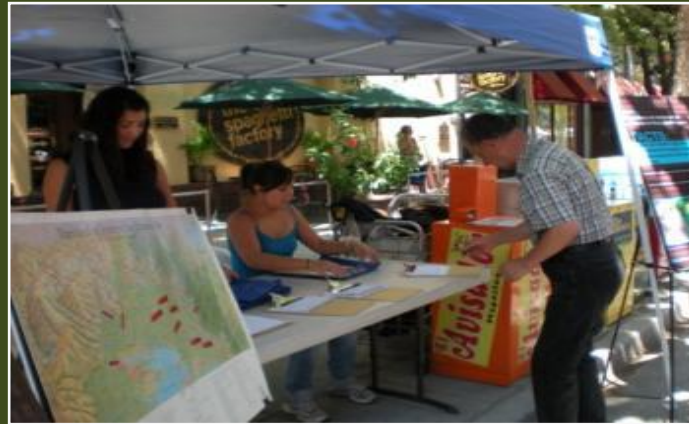
San José Retailers & Residents